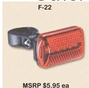
F-22 MSRP $5.95 ea 5-LED Programmable Pattern Light - Red or Amber Lens With Bicycle Bracket, Velcro Arm Band, and belt clip