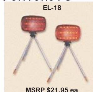
EL-18 MSRP $21.95 ea 18-LED Emergency Tripod Light Available in Red or Amber Lens Aluminum Adjustable Height Tripod Also Available in Red/Blue Strobe*

*Red/Blue Strobe for law enforcement only