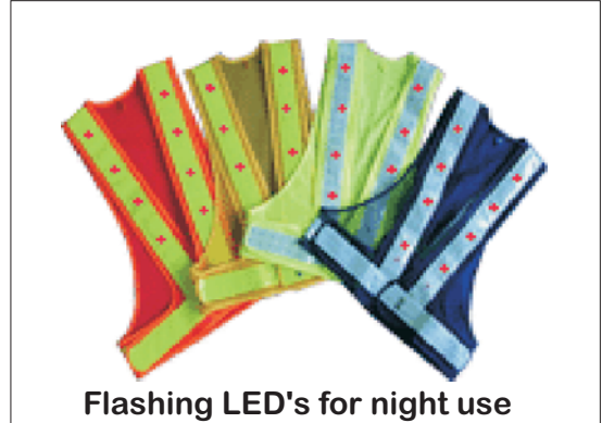
Flashing LED's for night use

MSRP: $24.95 ea (Regular Size) MSRP: $26.95 ea (Extra Large)